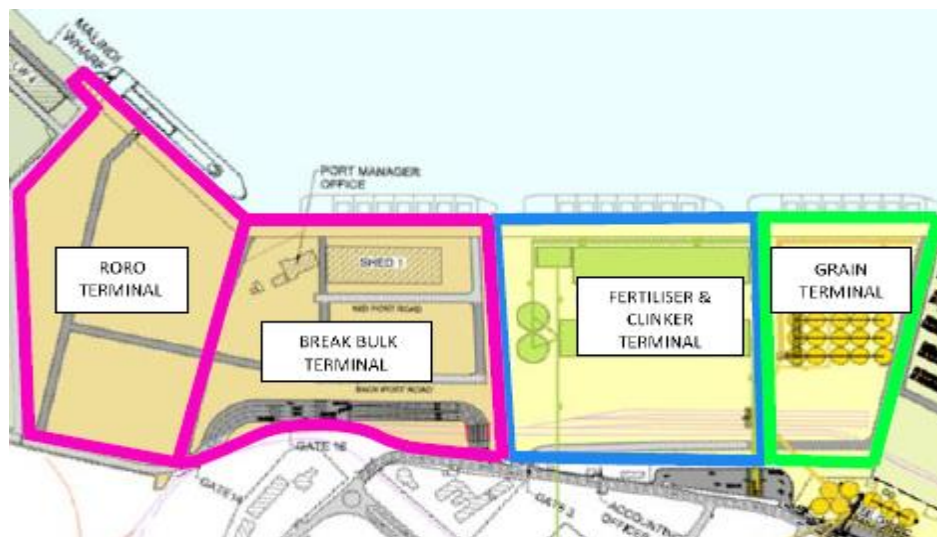
Figure 4: Terminal location in Dar Port

Potential overall cost effectiveness has been calculated in the MTBS reporting. A first report has set out economic and financial evaluations of the Berth 00 construction and berths 1–7 reconstruction. The report was in two parts, the first being for non-container operations as per the plan layout below: