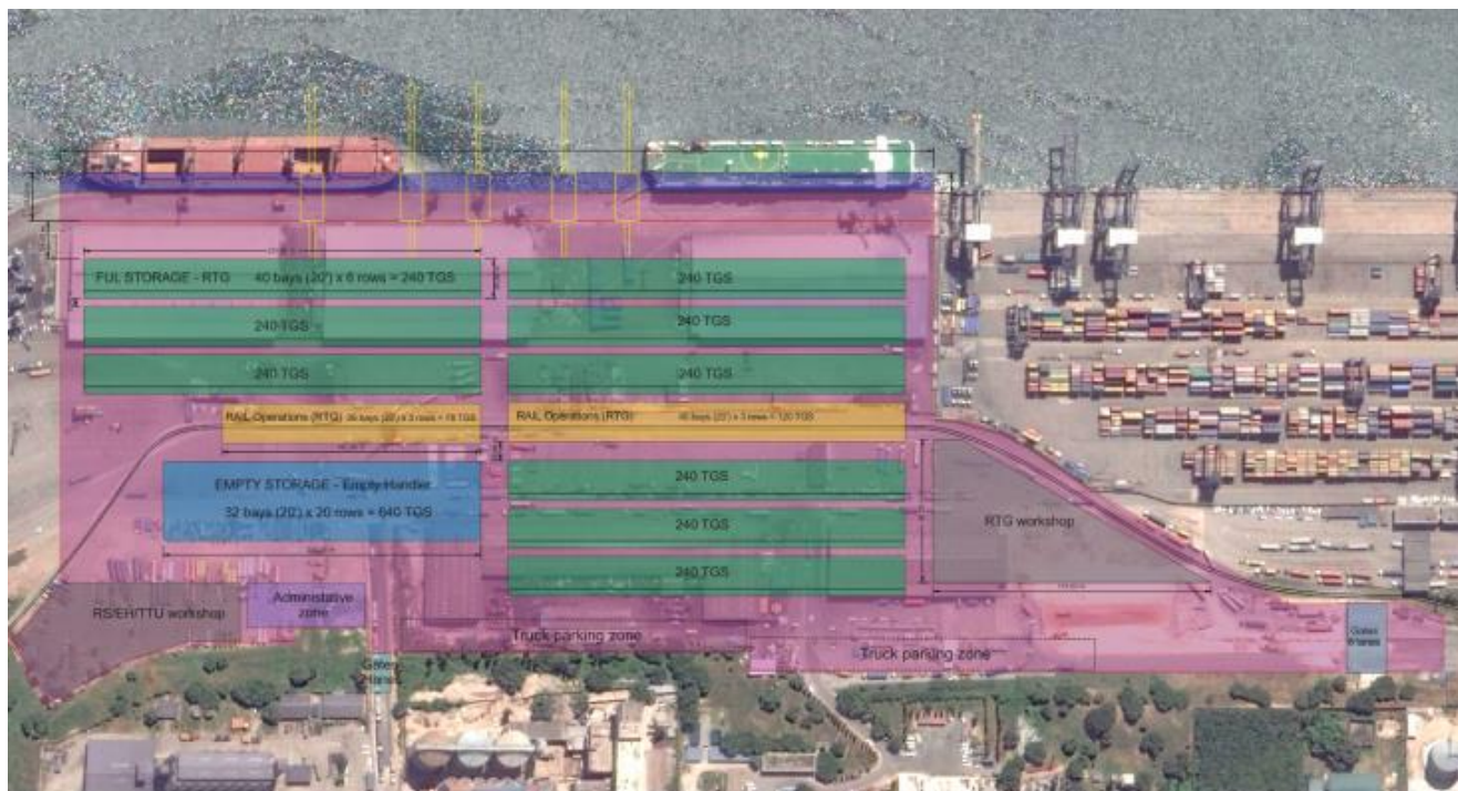
Figure 5: Dar Port berths 5–7 – reconstruction projections

The second part was for the use of reconstructed berths 5–7 as a container terminal as per the photo-montage plan below: