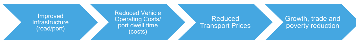
Figure 2: Linear pathway: Improved Infrastructure to Increased Trade

However, a deeper analysis on whether the income benefits and cost saving of improved port infrastructure and OSBPs are being passed on to lower cost of goods, increasing trade and that these benefits are pro-poor has yet to be undertaken. Reducing trade costs requires a range of policy and infrastructure interventions that go beyond direct improvements in new infrastructure. There is a relatively long impact pathway for SO1 (see Figure 2), which requires further data collection in the performance evaluation stage to be conducted in 2018-2019.